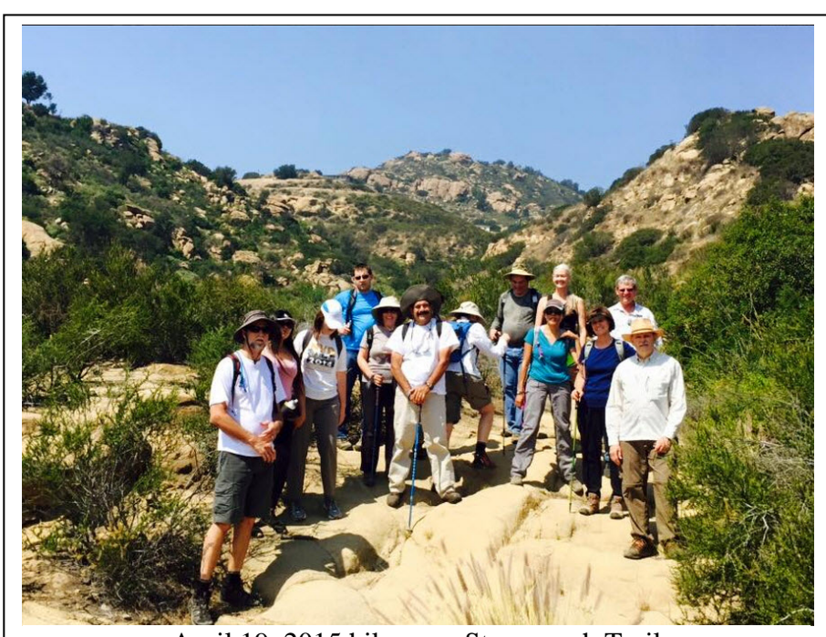
April 19, 2015 hikers on Stagecoach Trail

The rocks sure looked familiar, so we challenged our local Santa Susana Pass State Historic Park (SSPSHP) volunteers to hike the trail and find the exact location of this photo based on the background features.